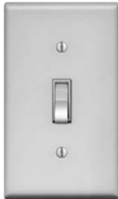
When you leave a room, remember to turn the lights off.

If the air conditioner is on, keep doors and windows closed. Don't go in and out, in and out. If you can, just use a fan and wear light clothes instead of using the air conditioner.